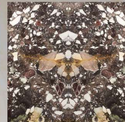
Mistio Della Gherardesca