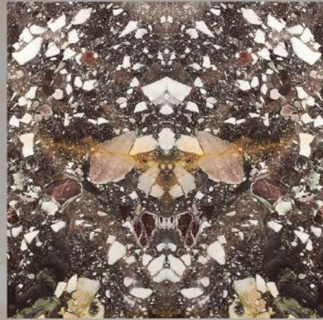
Mistio Della Gherardesca

Breccia with white and pinkish-white marble elements, as well as pink flint pebbles in a purple background paste,