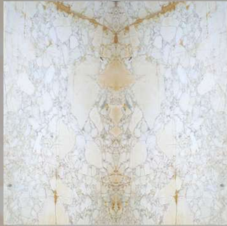
Calacatta Della Gherardesca

Breccia with rounded yellowish-pink elements and golden veins that form light streaks. The whole is crossed by mustard-yellow brocade veins, giving the slab a wonderful open-spot coloring.