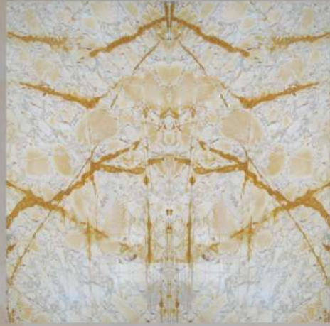
Calacatta Della Gherardesca

Breccia with rounded yellowish-pink elements and golden veins that form light streaks. The whole is crossed by mustard-yellow brocade veins, giving the slab a wonderful open-spot coloring.