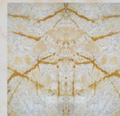
Calacatta Della Gherardesca