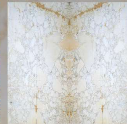
Calacatta Della Gherardesca