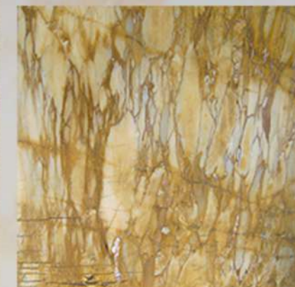
Calacatta Della Gherardesca Gold