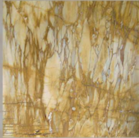
Calacatta Della Gherardesca Gold

Breccia with rounded yellowish-pink elements and golden veins that form light streaks. The whole is crossed by mustard-yellow brocade veins, giving the slab a wonderful open-spot coloring.